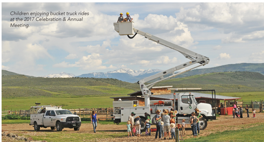
Children enjoying bucket truck rides at the 2017 Celebration & Annual Meeting.

Holy Cross Energy provides safe, reliable, affordable, and sustainable energy and services that improve the quality of life for our members and their communities.